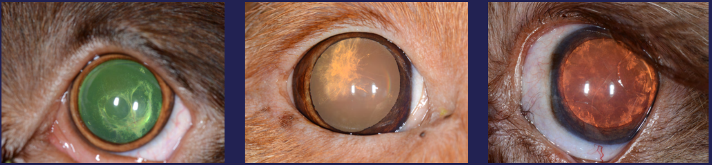
Figures 2 - 4 - Example of the different ways that cataracts can appear in dogs.

do not mind this part of the examination and it helps determine if the eyes are firm, but not too firm, and if there are irregularities or pain,